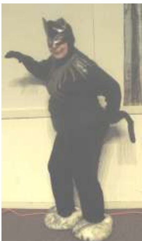
Black Cat Jean Simmons