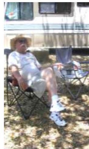
Flip found some shade