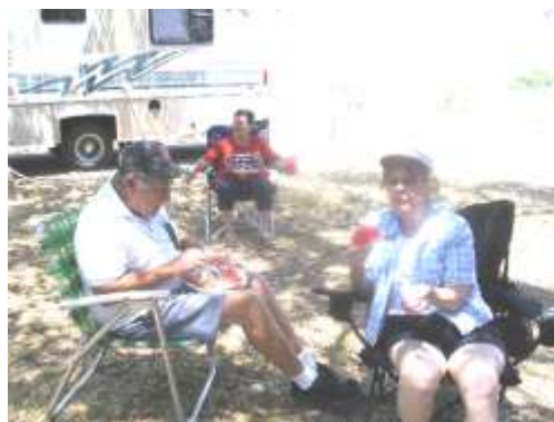
COOKOUT AT HORDS CREEK